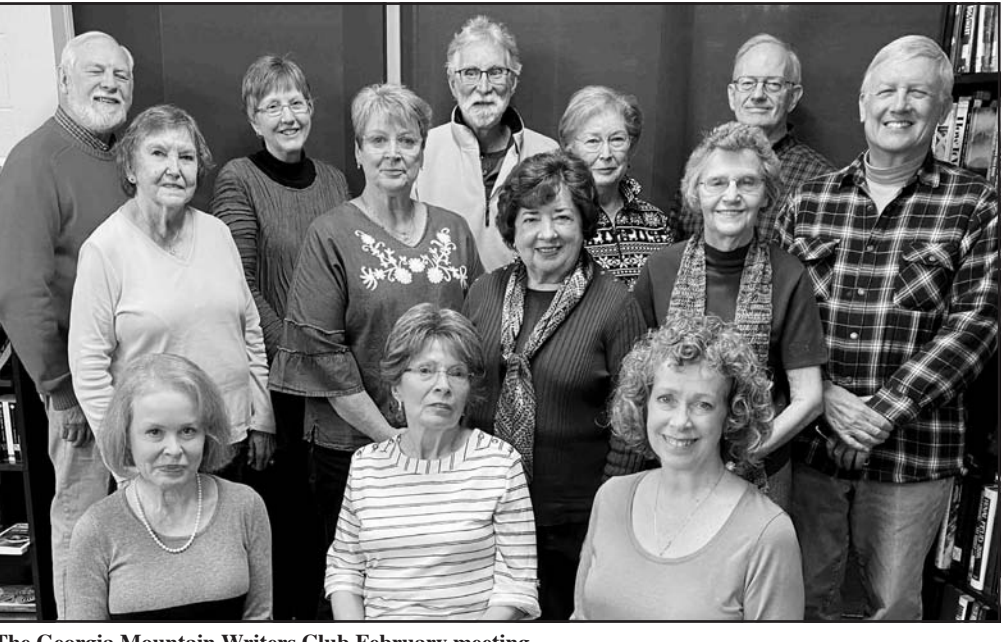
The Georgia Mountain Writers Club February meeting

The Georgia Mountain Writers Club last met in February to share stories and encourage one another's writing. We miss our monthly meetings and reluctantly, but willingly, practice safe distancing by not getting together. Reluctantly? Yes. We'd rather be together! Willingly? Absolutely. We all like staying healthy. So, we join everyone else by waiting for the day when we can meet